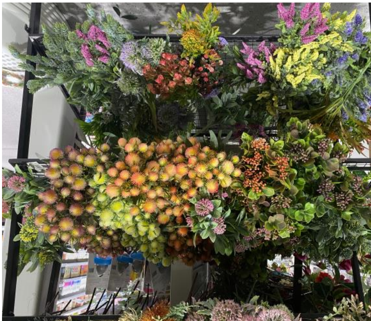
Examples at CHOICE, Morayfield.

Pick foliage that you like together— green tones, pink tones, grey-green tones. No thin foliage like grass.