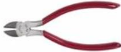
190mm Diagonal Pliers