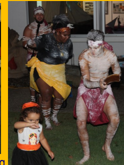
Waka waka dance