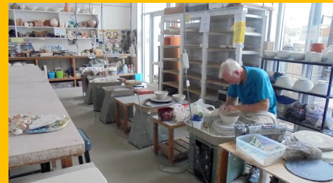
Potter on wheel Demo Day Sunday 9th