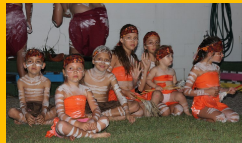
Waka waka dance troupe