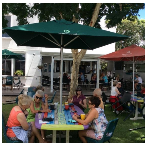
Bribie VIEW club members drop in.