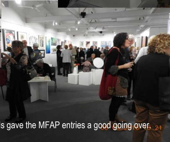
Crowds gave the MFAP entries a good going over.