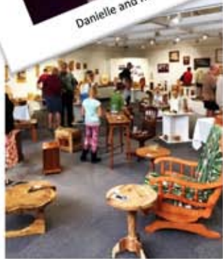
Treasures Beneath the Bark