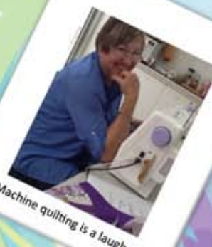
Machine quilting is a laugh.