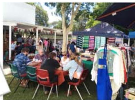
Splendour on the grass