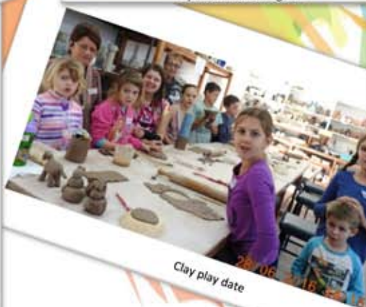
Clay play date