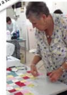
Cutting a square deal